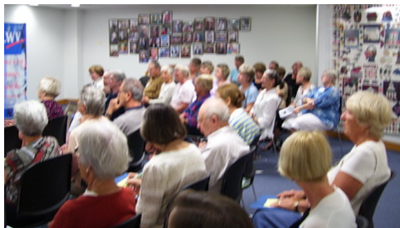
The first meeting of the Sanibel MAL unit of the League.